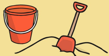
bucket and spade